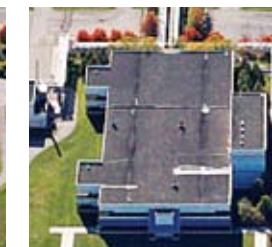
640 Building Office Building & Data Center