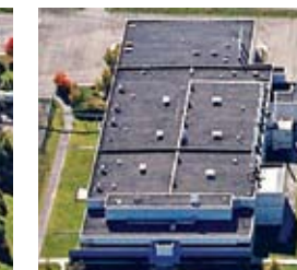
650 Building Class '1' Clean Room Facility