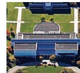
600 Building Central Administration Building