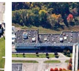
690 Building Utility Plant