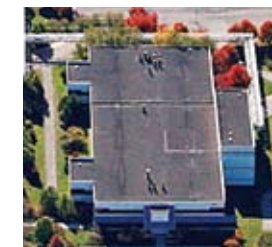
630 Building Office Building